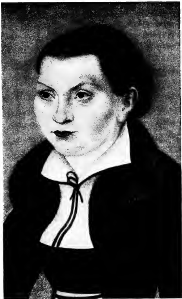
Portrait of CATHERINE LUTHER By Cranach. Original in Milan.